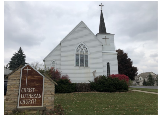
Christ Evangelical Lutheran Church, N168 W20152 Main Street (Highway 60) Jackson, Wisconsin.