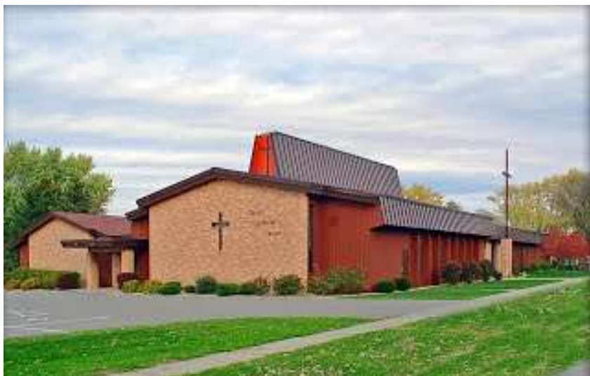
Christ Lutheran Church 237 East Daley Street, Spring Green, WI

Directions to Christ Lutheran from Highway 14: Take Highway 23 into Spring Green and proceed south about one-half mile, turn west onto Daley Street. The church is about one block west on the north side of the street with ample parking.