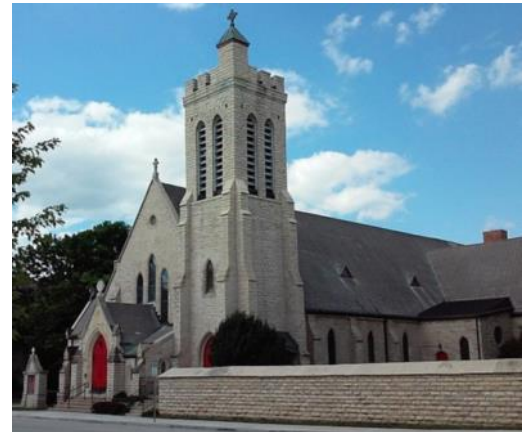
The Historic Cathedral Church of Saint Paul the Apostle, 51 W. Division Street, Fond du Lac, WI