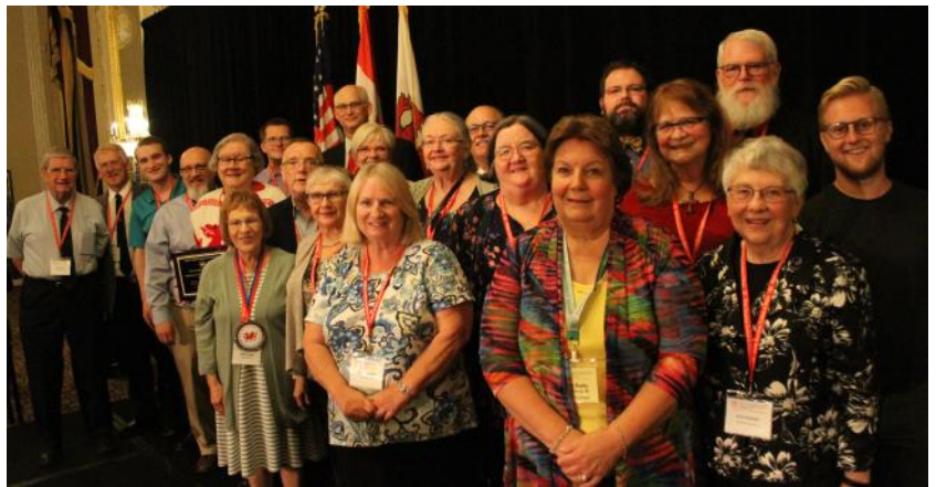
Trustees from the WGGAW receive the NAWF Heritage Medallion