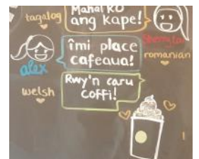
A coffee shop in Milwaukee

Article excerpted from HWYL, newsletter of the WNAA