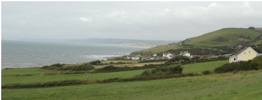
2010 Photo of the West Coast of Wales

The above is copied from the Welsh and English Hymns and Anthems (Reformatted), printed by The Welsh National Gymanfa Ganu Association, Inc.