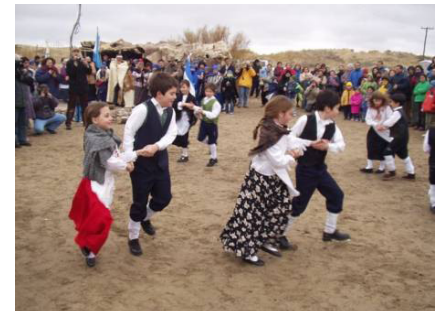
Welsh traditional dancing in Patagonia

2018 event will be at the same location we've used for past several years: Rosebrook Park in Roseville, 11:30–2:30 p.m.