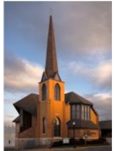
First Presbyterian Church, 416 Ash Street, Baraboo